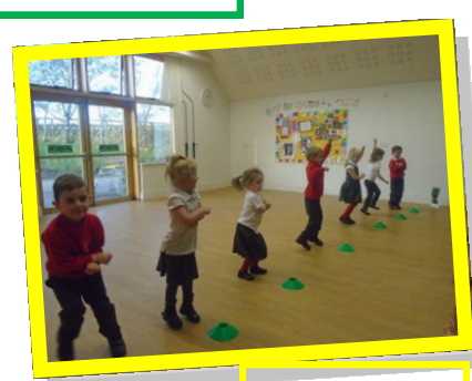
Class One "Pop"