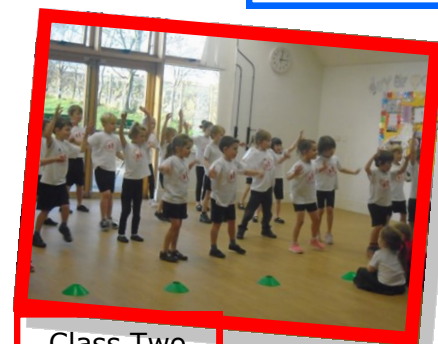
Class Two "Jazz"