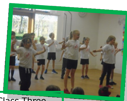
Class Three "Musical Theatre"